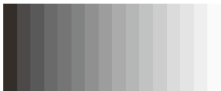
Low gray scale