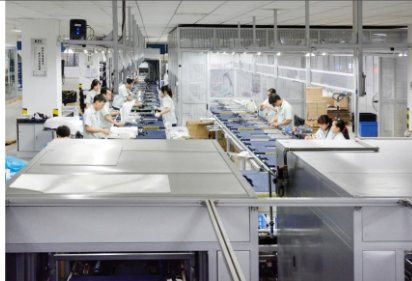
Commercial display product assembly line