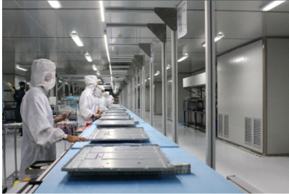
Module production line