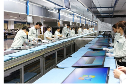
Professional display product assembly line