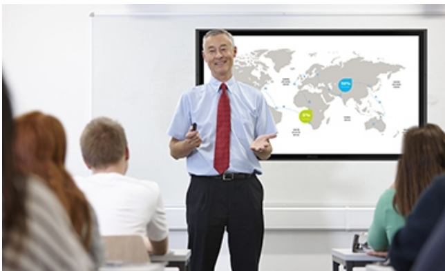
Education and training